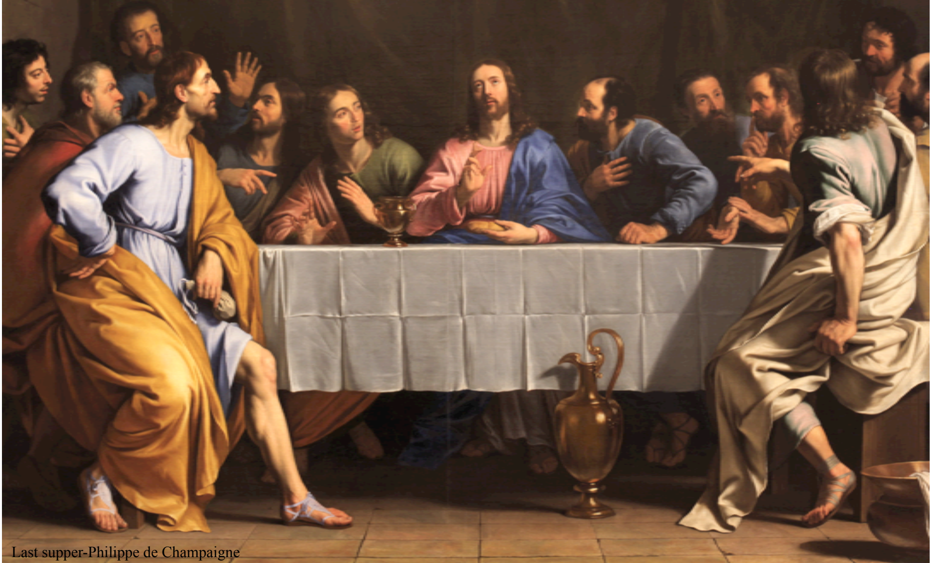
Last supper-Philippe de Champaigne

But now I go away to Him who sent me, and none of you asks me, Where are you going? But because I have said these things to you, sorrow has filled your heart. Jn. 16:5-6